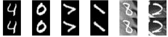
Table 3: The original (the top row) and successfully perturbed (the bottom row) images.

network is robust against adversarial inputs.